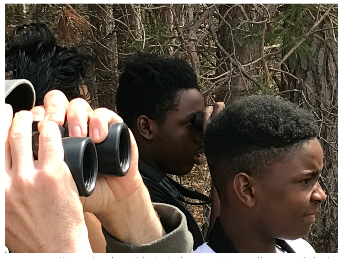
Murray students observe birds in local park to compare bird count with nearby neighborhood.