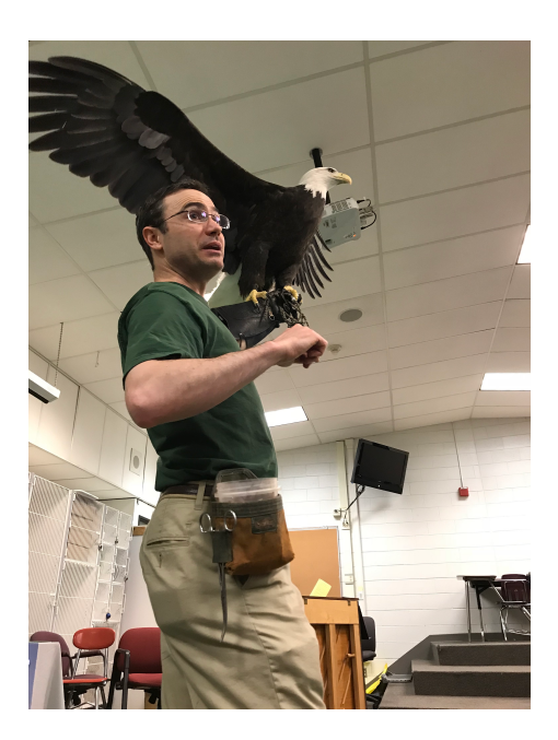
The Raptor Center visits Murray Middle School to teach students about the physical adaptations of raptors.