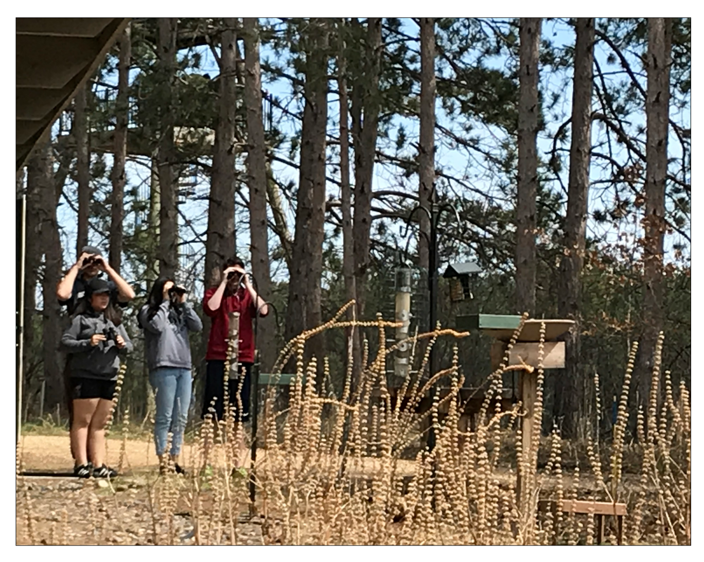
Murray students observing birds at Belwin Outdoor Science Center